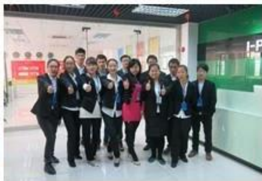
Shanghai International Photovoltaic Power Generation Conference & Exhibition