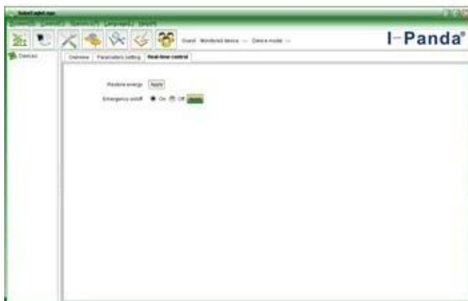
Upper computer software on/off interface and generating capacity record clean interface