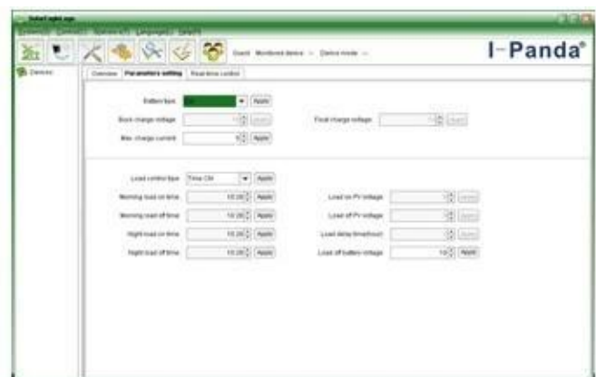
The interface of upper computer software parameter setting state