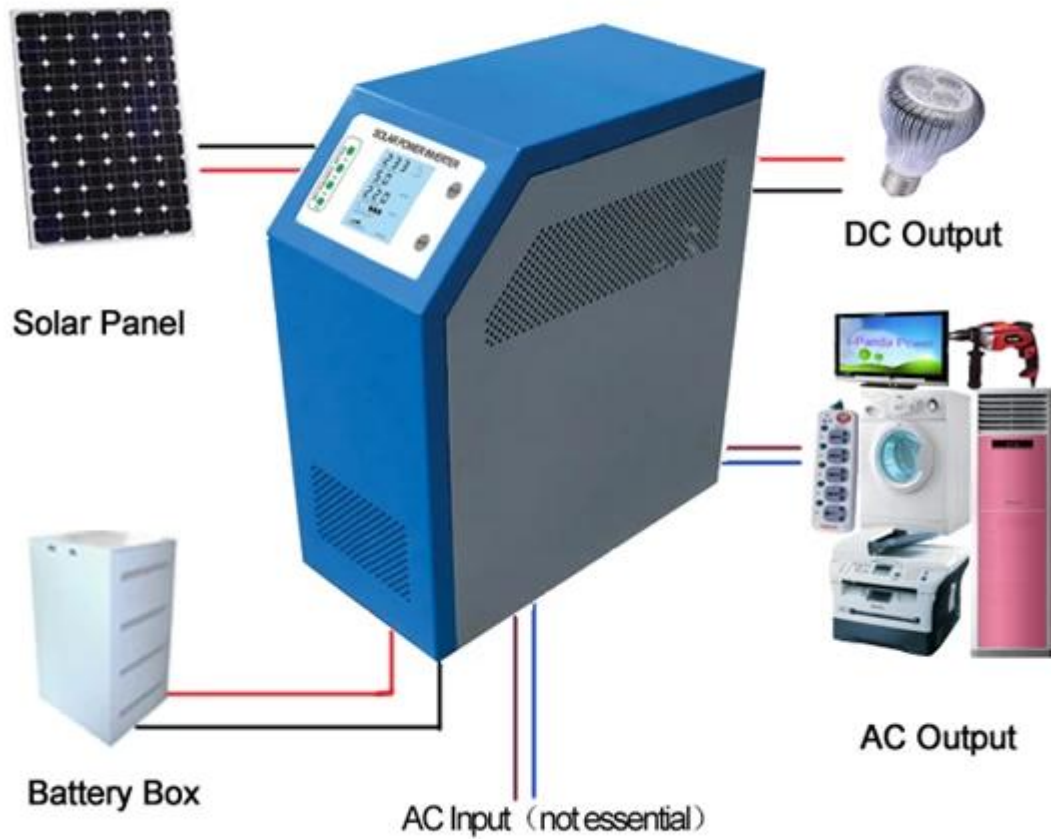
I-P-SPC-Series Inverter+Solar Controller