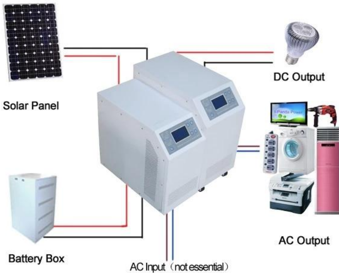
I-P-HPC-Series Inverter+MPPT Solar Controller