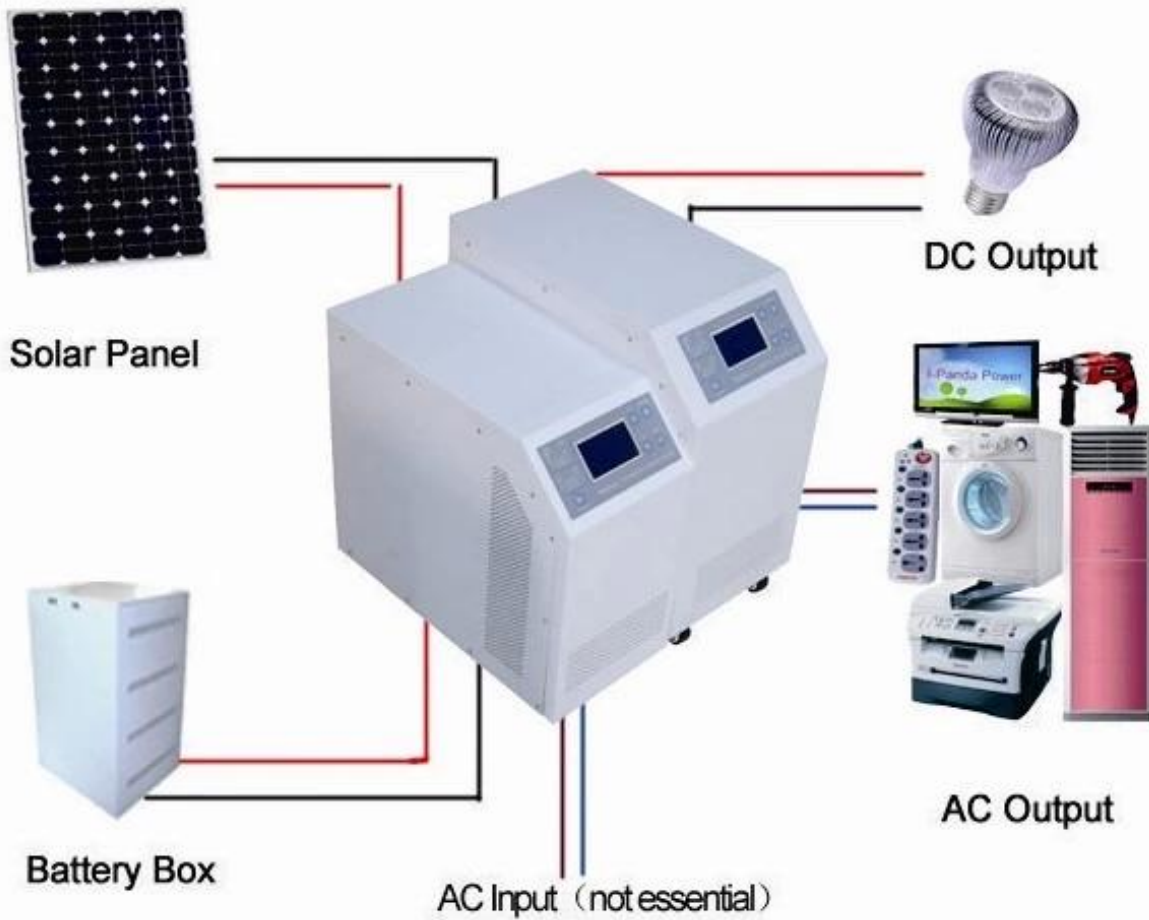
I-P-HPC-Series Inverter+Solar Controller