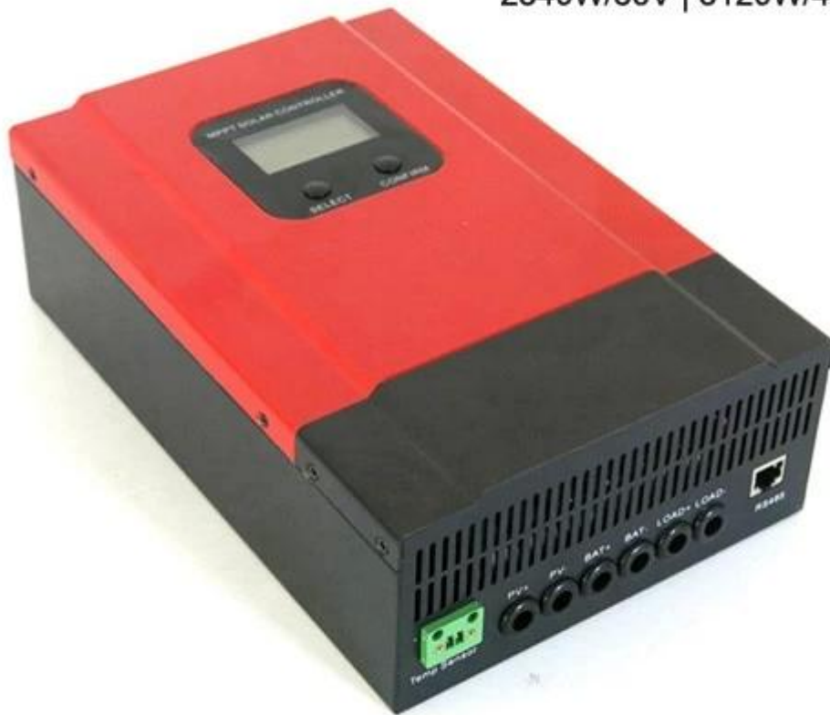
MPPT Controller eSmart-60A

PV Voc 150V 12/24/36/48V Auto 780W/12V | 1560W/24V 2340W/36V | 3120W/48V