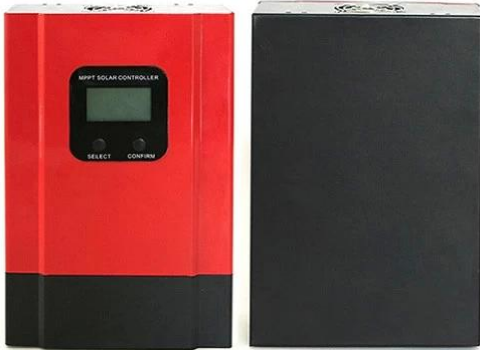
MPPT Controller eSmart-60A

PV Voc 150V 12/24/36/48V Auto 780W/12V | 1560W/24V 2340W/36V | 3120W/48V