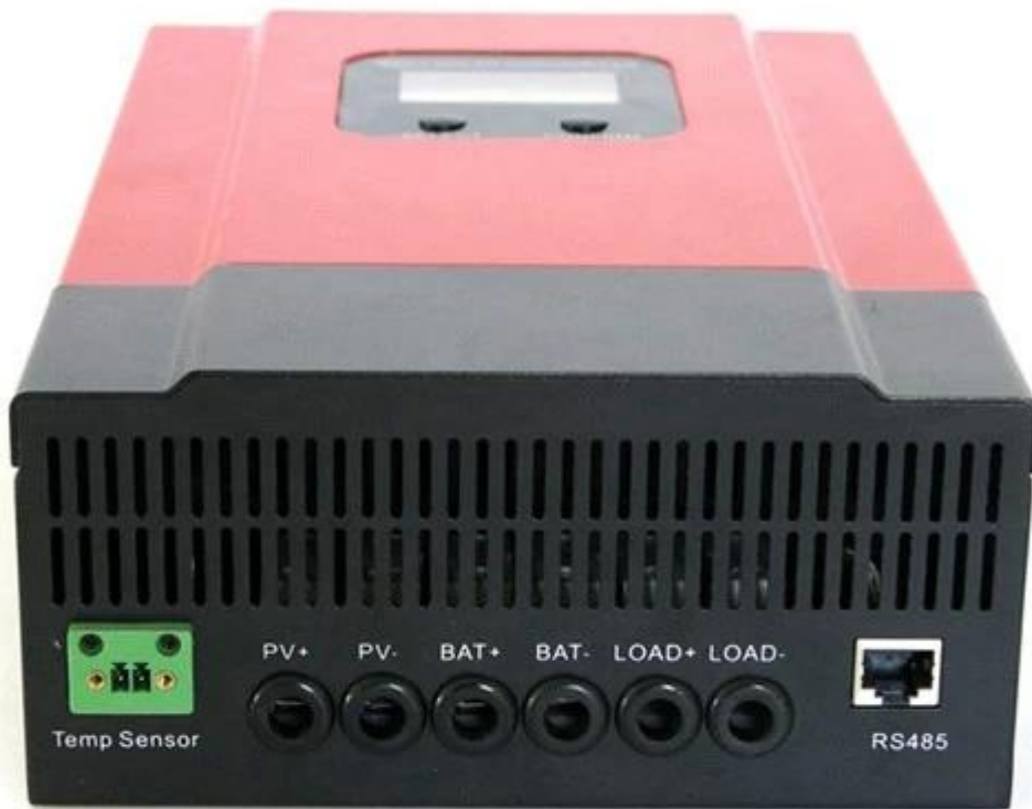
MPPT Controller eSmart-60A

PV Voc 150V 12/24/36/48V Auto 780W/12V | 1560W/24V 2340W/36V | 3120W/48V