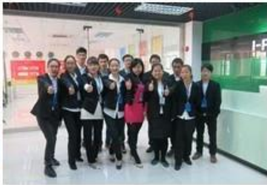
Shanghai International Photovoltaic Power Generation Conference & Exhibition