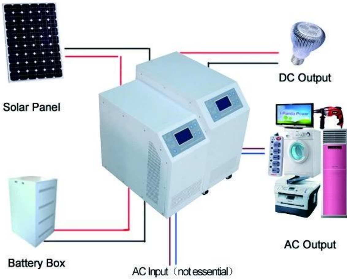
I-P-HPC-Series Inverter+Solar Controller