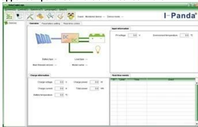
The interface of upper computer software working state