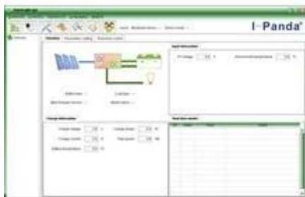
Upper Computer Software