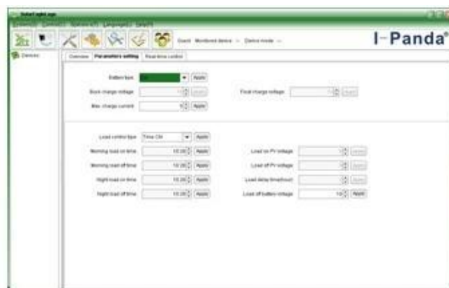
The interface of upper computer software parameter setting state