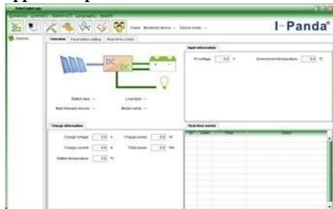
The interface of upper computer software working state