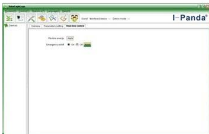
Upper computer software on/off interface and generating capacity record clean interface