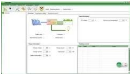
Graphical: PC upper software

1.Controller PC upper software and testing software can display information. Users can set parameters via PC upper software.