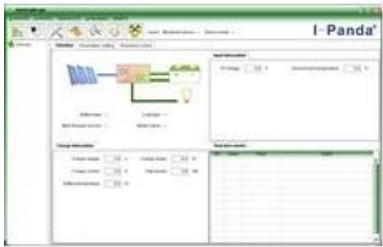
Upper Computer Software