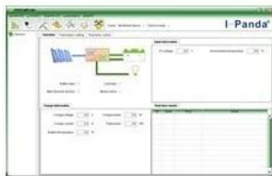
Upper Computer Software