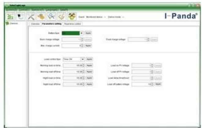
The interface of upper computer software parameter setting state