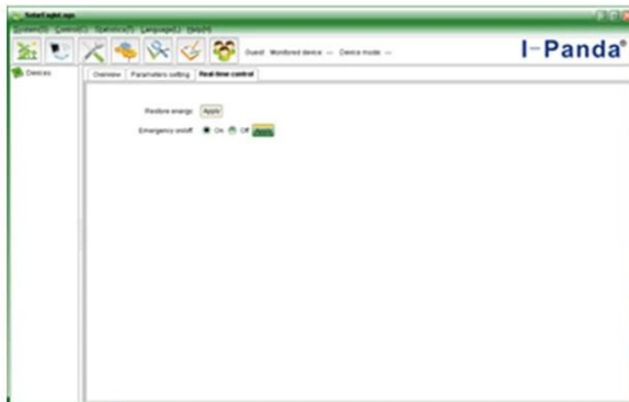
Upper computer software on/off interface and generating capacity record clean interface