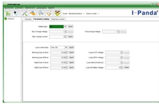
The interface of upper computer software parameter setting state