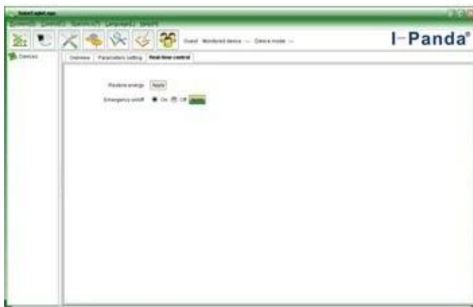
Upper computer software on/off interface and generating capacity record clean interface