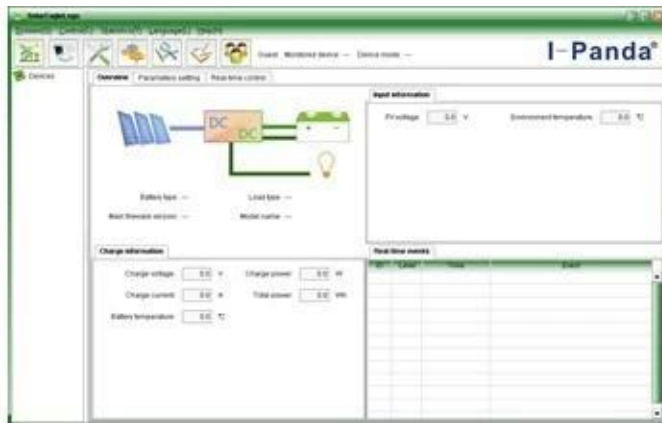
The interface of upper computer software working state