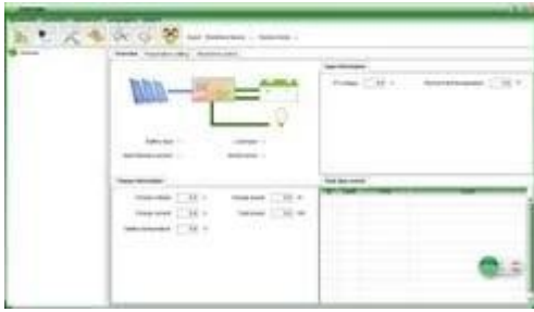
Graphical: PC upper software