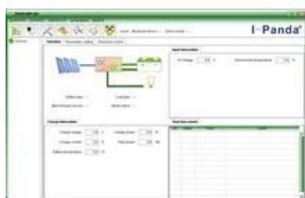
Upper Computer Software