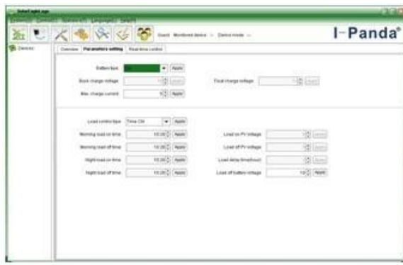
The interface of upper computer software parameter setting state